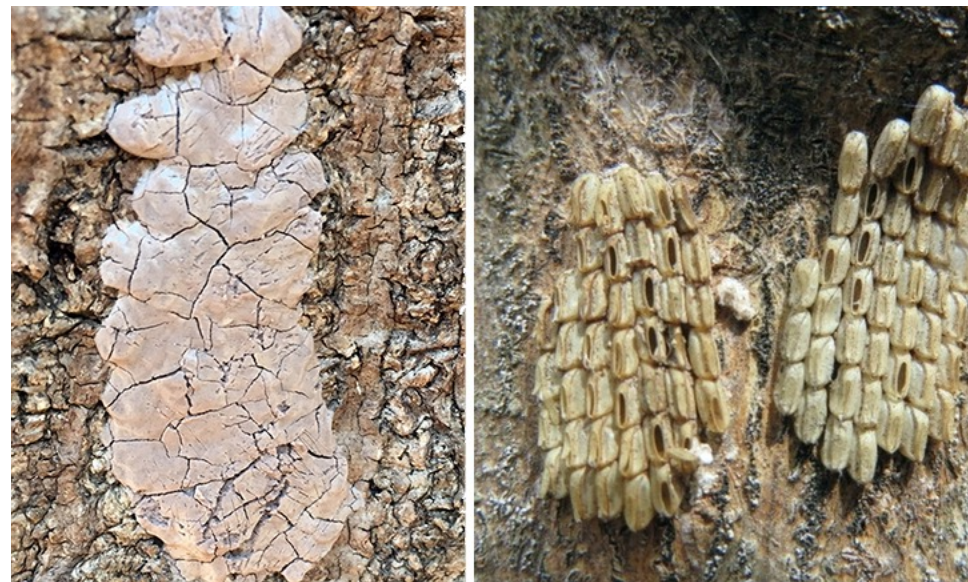
Unhatched egg masses (left) mass with some hatching.