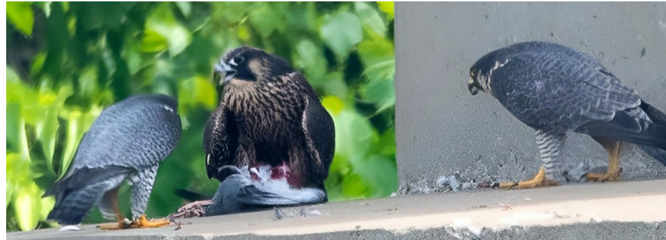
The fledgling (center) receives a meal of pigeon, with her father (left) and mother (right).