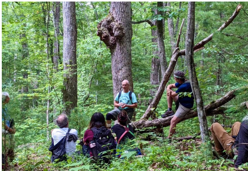
The Conservancy's Watoga State Park old-growth forest outing in July.