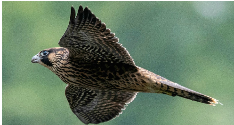
The young falcon rescued from the river is returned to the bridge and flies to find her parents after rehabilitation.

Peregrine falcons were listed as a federally endangered species from 1970 through 1999. In the 1980s, the state began establishing peregrine nesting sites with the National