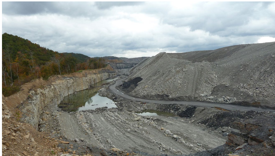
The Hobet Mine in Lincoln and Boone counties, West Virginia. Originally owned by Patriot Coal and now owned by ERP.

Strip mining is regulated by what bureaucrats call a system of “cooperative federalism.” Under the federal Surface Mining Control and Reclamation Act, which passed in 1977, states could either enact their own program, which is just as effective as the federal act or sit back and allow the federal Office of Surface Mining to step in and regulate mining in their state. West Virginia chose to enact its own program. The Office of Surface Mining would have to approve the program by determining that it was as effective as the federal statute.