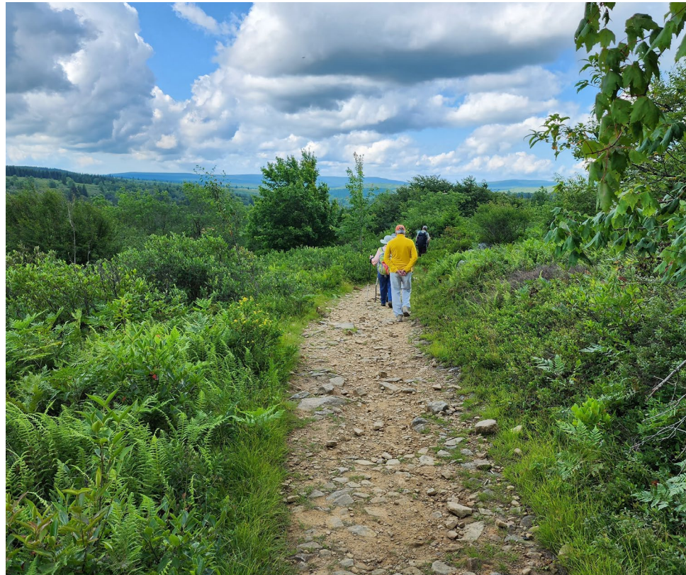
A hiking trail in Dolly Sods Wilderness Area

It was pointed out that the key provisions of the Act called for wilderness to be “untrammeled [free of human control],” “retaining its primeval character and influence,” “managed to preserve its natural conditions” “with the imprint of [human’s] work substantially unnoticeable” and providing an opportunity for “a primitive and unconfined type of recreation.” All of these seem to point to a vision where any evidence of human improvement or “infrastructure” must be strictly absent. And if you factor in the principles of Leave No Trace, what is more literally a “trace” than a well-worn pathway created by human visitors through